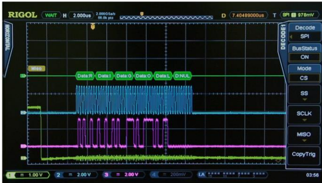
Figure 1: Basic SPI analysis with analog oscilloscope channels