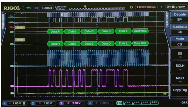
Figure 3: Comparison with mixed signal channels for data interpretation

In this test, we can see that our connections appear to have more than enough bandwidth but we can also see some crosstalk noise especially on the data and chip select lines. The green bus values are an internal decode of that signal by the scope. As long as these are stable for each transmission then the noise is likely acceptable. Since crosstalk is a common issue here it can be important to test the bus while other peripherals are being serviced and activated asynchronously. One methodology is to utilize a pass/fail mask, which we have implemented in Figure 2, looking for unacceptable noise levels in a large sequence of traces.