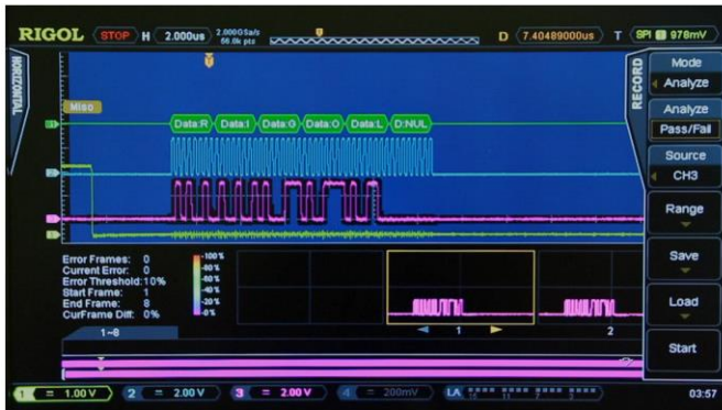
Figure 2: Pass / Fail Analysis to highlight crosstalk on a communication bus